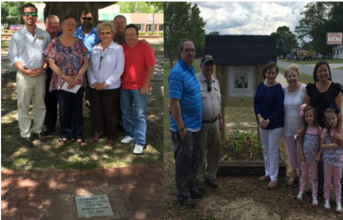
Park Dedication Sunday